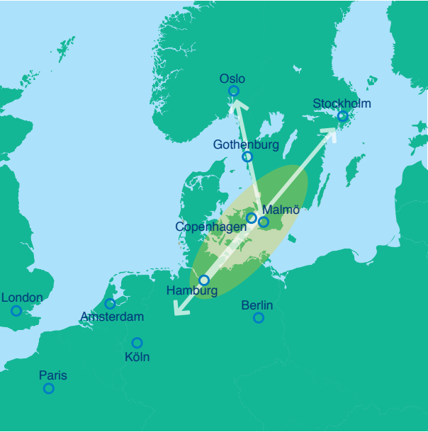
The STRING-corridor seen in the conjunction with the corridors towards Oslo and Stockholm (PICTURE: STRING).

The STRING organisation will coordinate and promote the common agenda of the partners; and its work shall build on the politics and initiatives that are part of the partner’s political agendas, priorities and activities. The STRING dimension will be the extra dimension that emerges when common objectives and actions are put forward on behalf of the common entity of Northern Europe’s strongest economy – either to the 8,3 million inhabitants in the STRING Corridor, to the national governments and to the EU or other stakeholders.